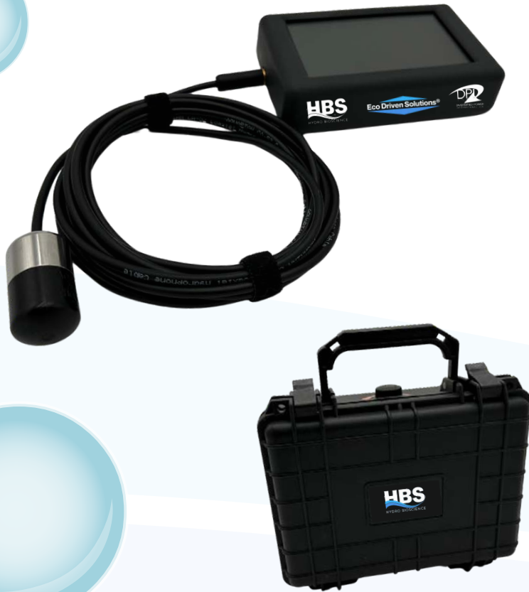
HEAVY DUTY CASE